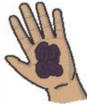
1/4 cup of dried fruit