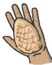
2 - 3 ounces of cooked meat