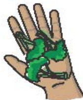
3 broccoli florets