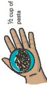
1/2 cup of pasta