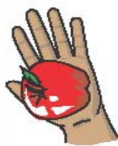
1 medium apple