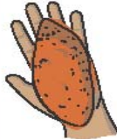
1 medium sweet potato