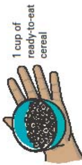
1 cup of ready-to-eat cereal