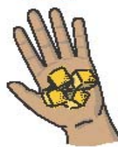
4 cubes of cheese (dice size)