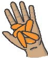
6 baby carrots