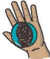
1/2 cup of cooked beans