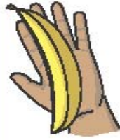
1 small banana