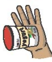
1 cup of low-fat yogurt (8 oz.)