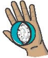
1/2 cup of cottage cheese