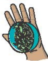
1 cup of raw leafy vegetables