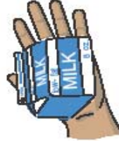
1 cup of low-fat/skim milk (8 oz.)