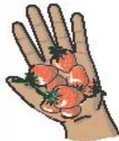
1 handful of strawberries