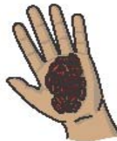
1/3 cup of nuts