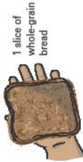
1 slice of whole-grain bread